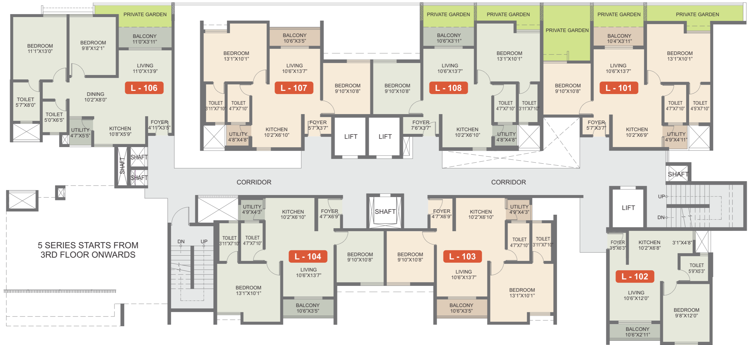
Area statement (sq.ft.)