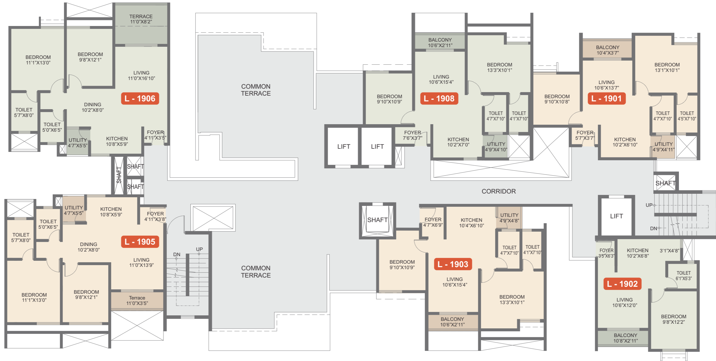
Area statement (sq.ft.)