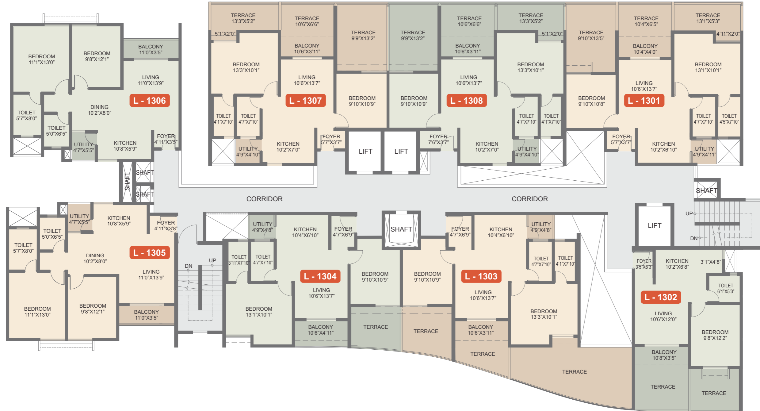
Area statement (sq.ft.)