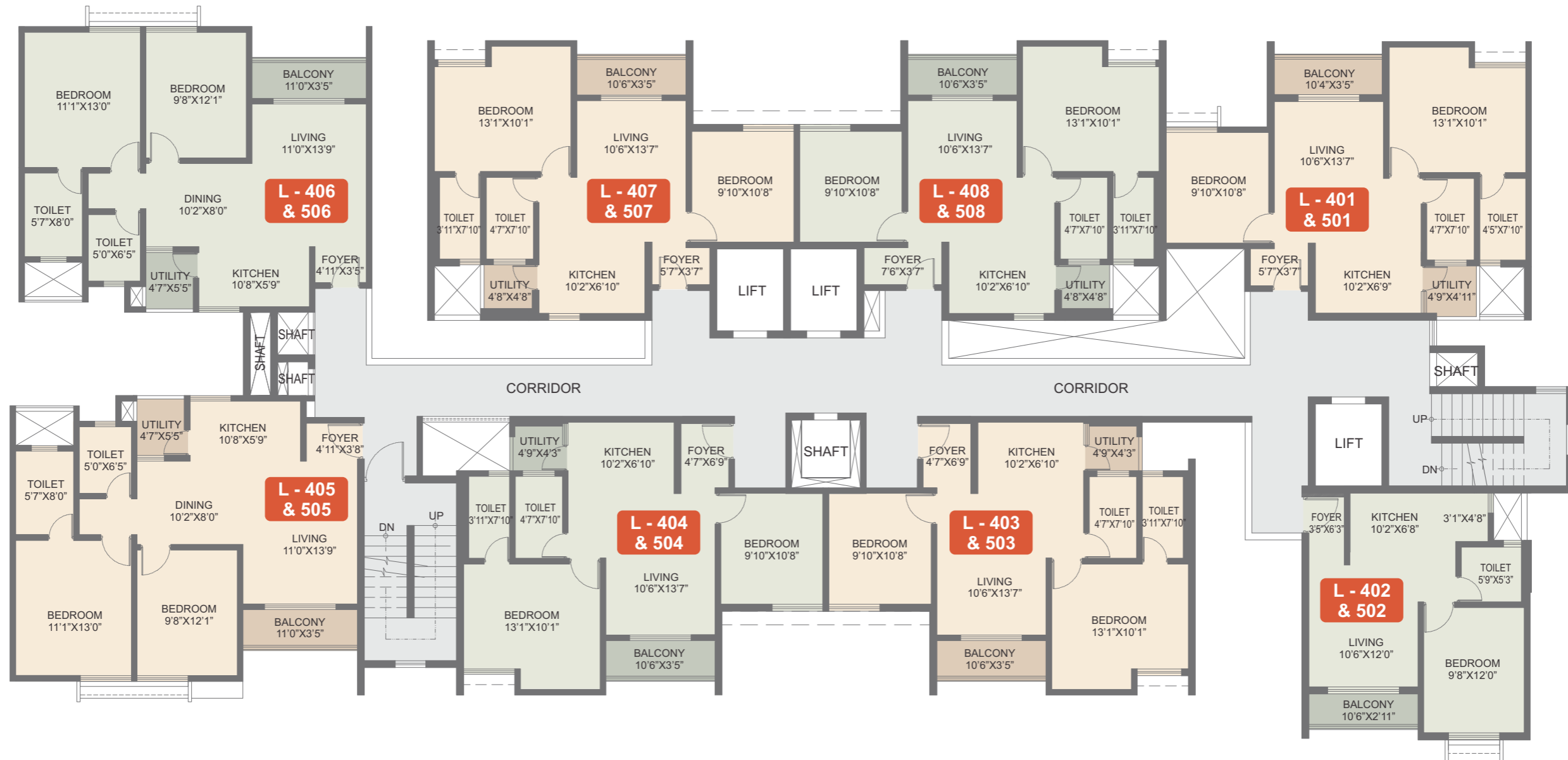
Area statement (sq.ft.)